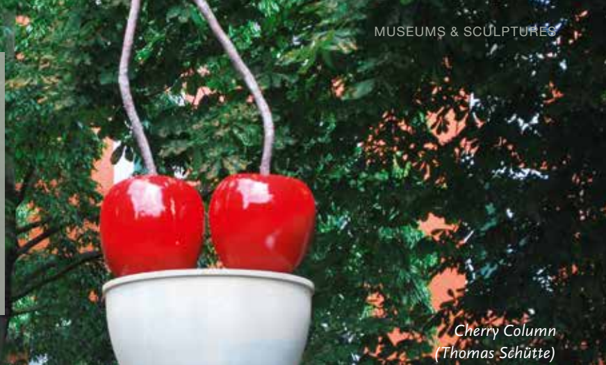
Cherry Column (Thomas Schütte)

Or you can investigate the works of art with the SkulptTour App, which can be obtained free of charge at >> www.skulptour-muenster.de/en